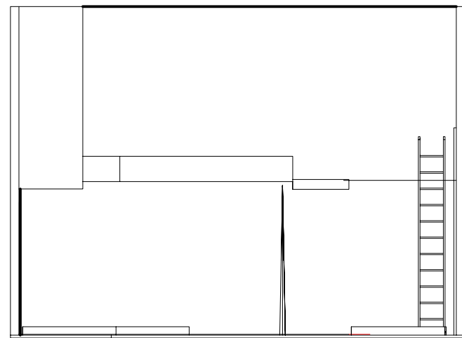
5 Side View Scale: 1/8" = 1'-0"